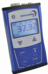
Audit UT Gauge Range