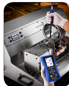
MagnaCheck Field Strength Meters