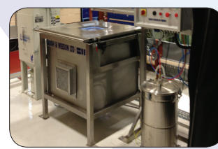
Dust Storm Cabinets