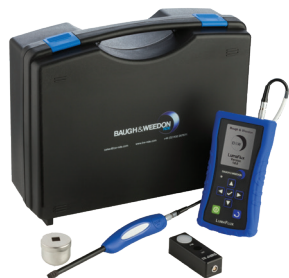
LumaFlux Combined Dual UV & White Light, and Tangential Field Strength Meter.