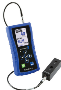
LumaCheck Dual UV & White Light Meter