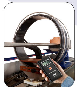
Audit Range of Shot Timers