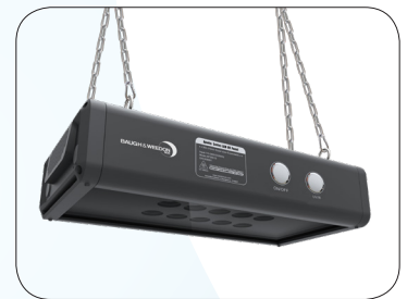
Apollo Series Overhead LED Technology