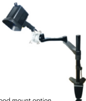
Tripod mount option