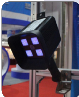
Pole mount option