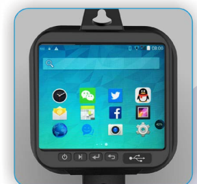
Android Based O/S