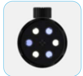
UV/White Light Endoscope