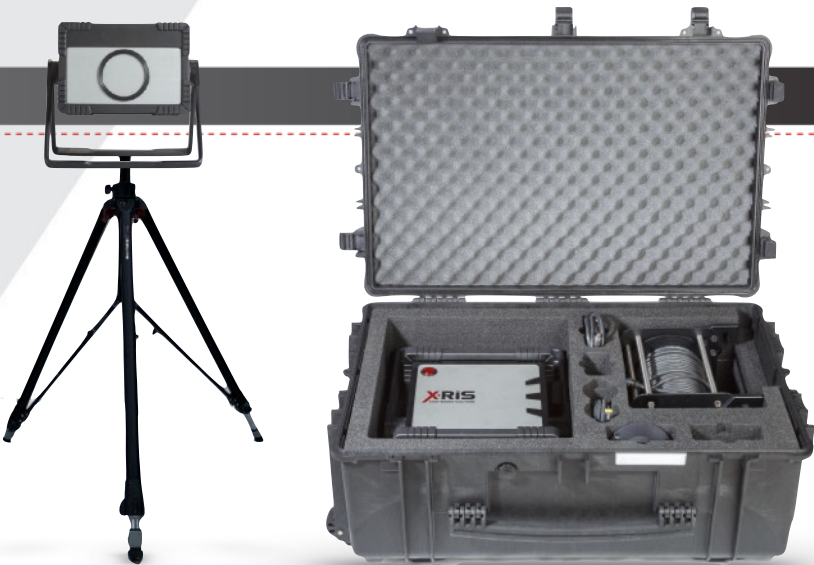
IMAGE QUALITY AND CLASS B IMPROVEMENT THANKS TO μGemX